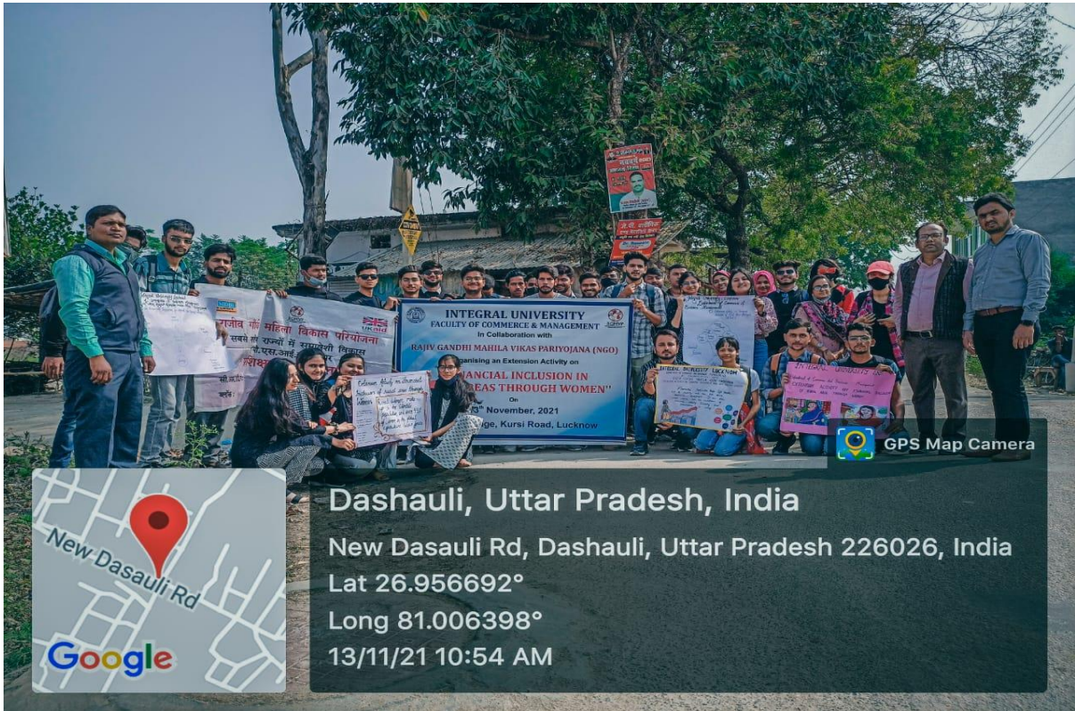
Photograph taken during the Extension Activity in Dasauli Village